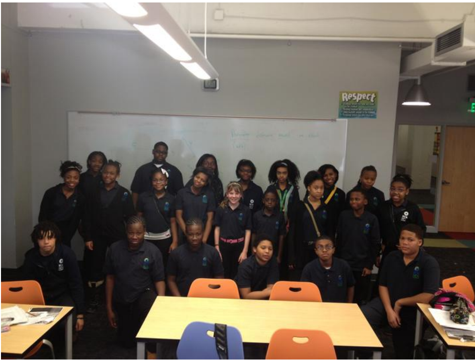
6th Hour Class