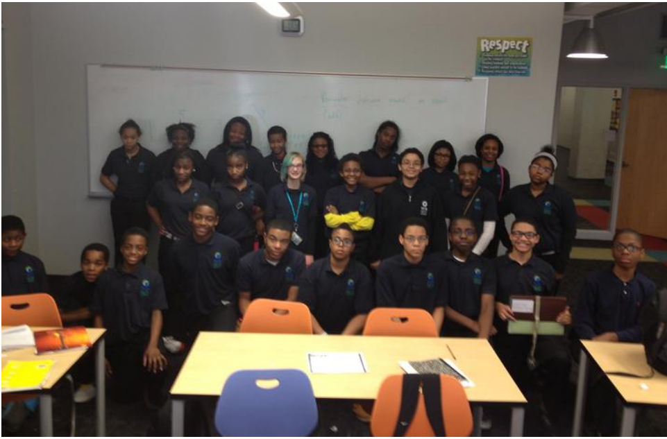
5th Hour Class