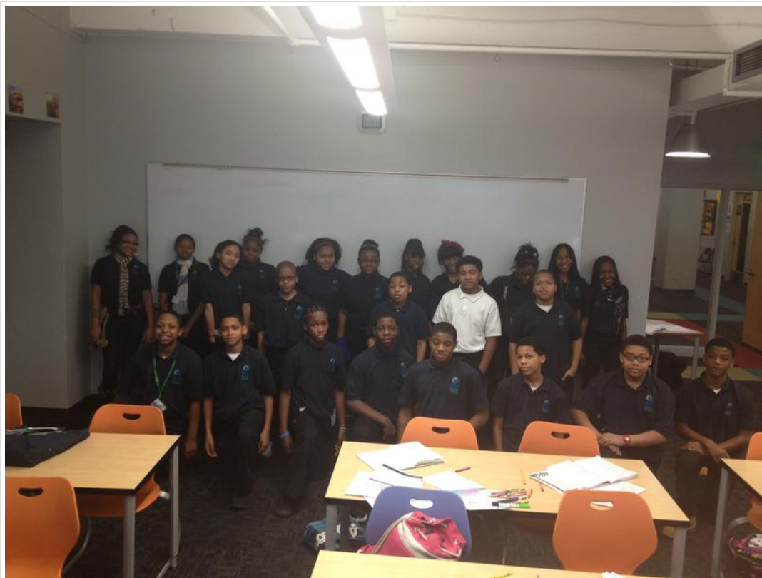
3rd Hour Class