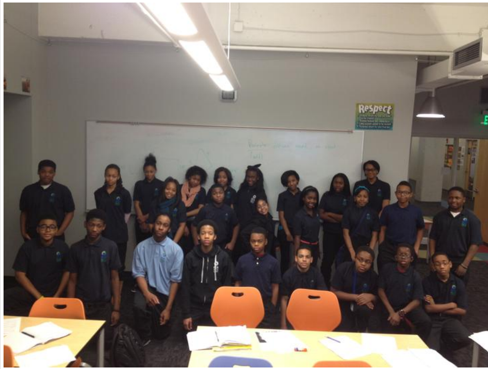
1st Hour Class